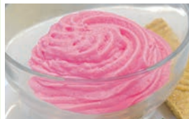
Mixed berry mousse & apple wedge