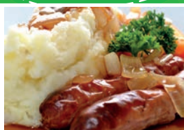
Nottinghamshire sausages, mashed potatoes seasonal vegetables