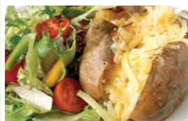
Jacket potatoes with cheese, beans or tuna mayonnaise & mixed salad