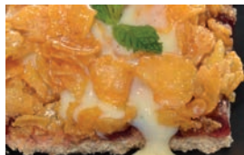
Cornflake tart & custard