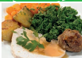
Roast turkey & stuffing gravy roast OR mashed potatoes cabbage & carrots