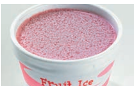
Strawberry ice cream tub