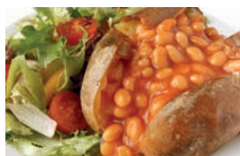
Jacket potatoes with cheese, beans or tuna mayonnaise & mixed salad