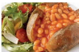
Jacket potatoes with cheese, beans or tuna mayonnaise & mixed salad