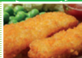
MSC fish fingers diced potatoes garden peas & crunchy veg, tomato ketchup