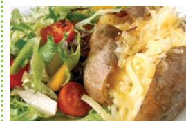
Jacket potatoes with cheese, beans or tuna mayonnaise & mixed salad