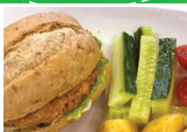
Southern style burger in a bun jacket wedges carrot sticks & ranch salad