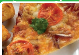
Margherita pizza pommes noisette vegetable sticks